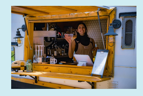
Venders provided refreshments for Walk participants.