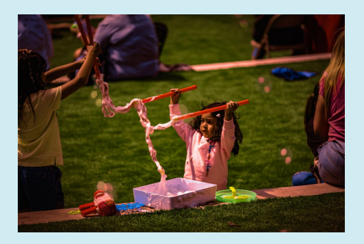
More activities to entertain the kids.