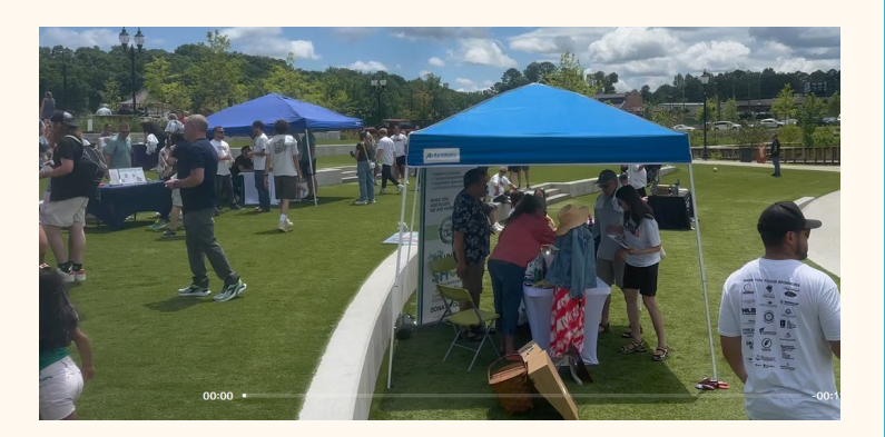
We had 25 community resource tables and many partners in prevention efforts that provided information to all who attended.